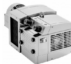
5.5kW high-efficiency dry-vane vacuum pump