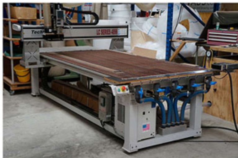
Techno 4896 - 7kW manual collet spindle

Reliable and easily operated tabletop CNC Router. Used since 2006 in pattern & mouldmaking in mdf and tool Excellent engraver or small tool